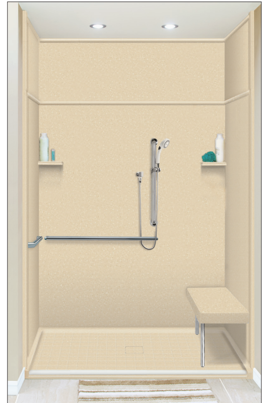
Shown with FC6338 Shower Base, X6382 Extension Wall Kit, GB3729PS Grab Bar Set, H2513 Shower Seat, GBHS18PS Hand Shower with 18" ADA grab bar.